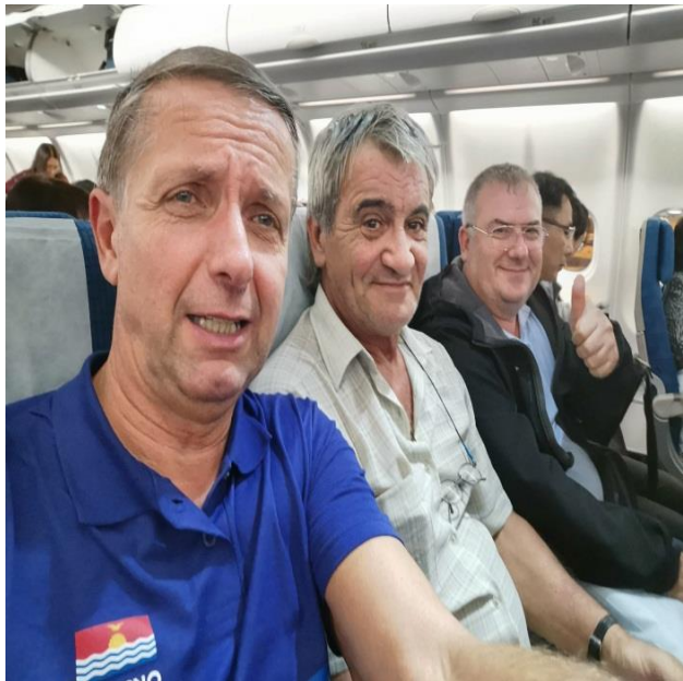
The T30GC team aboard the aircraft