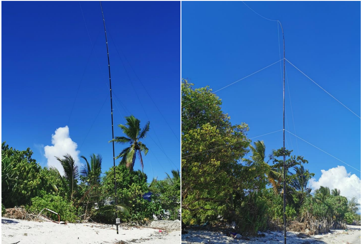
Our two Vertical antennas for low bands, both used on 160/80/40m bands

On October 8, 2019, afternoon, the T30GC was already on the air with 3 operating places on 40/30/20 m, CW. Throughout the night we continued to work on the Air at 160, 80 and 40 meters with two places.