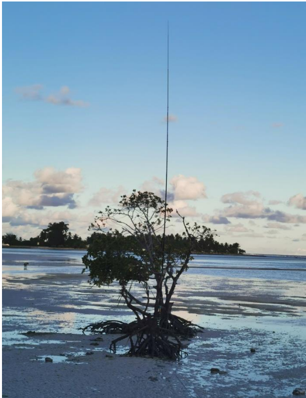
Our 30 m Vertical antenna

The installation and adjustment of these antennas took us a long time because we had to lift the tuning devices to these antennas about 80 cm from the bottom