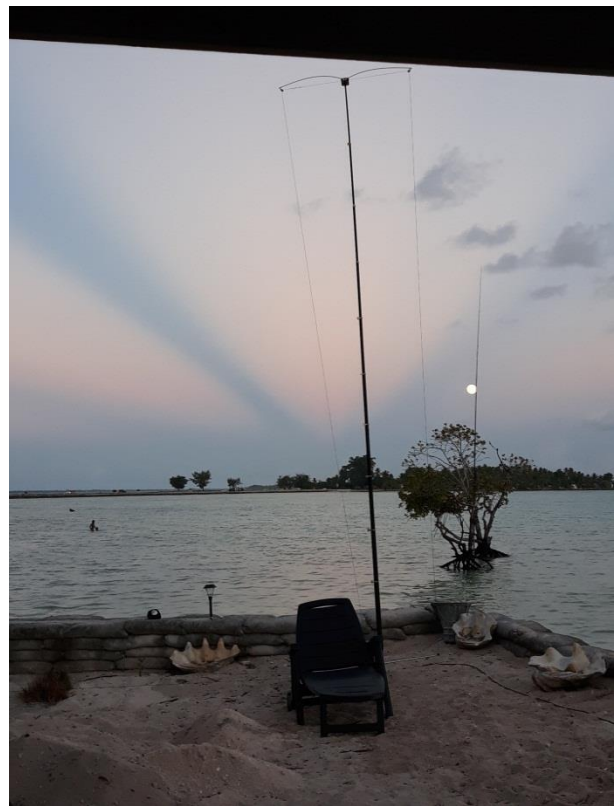
Our Crank IR antenna

Stan (LZ1GC) and Mitko (LZ3NY) started to prepare the 18 m masts for vertical antennas on 160/80/40 m bands. We had 2 such antennas, but unfortunately, we were unable to install them immediately after our arrival due to the fast approaching evening. At the same time, it struck me that the coastline is very narrow at the time of tide. This was a problem for the installation of our vertical